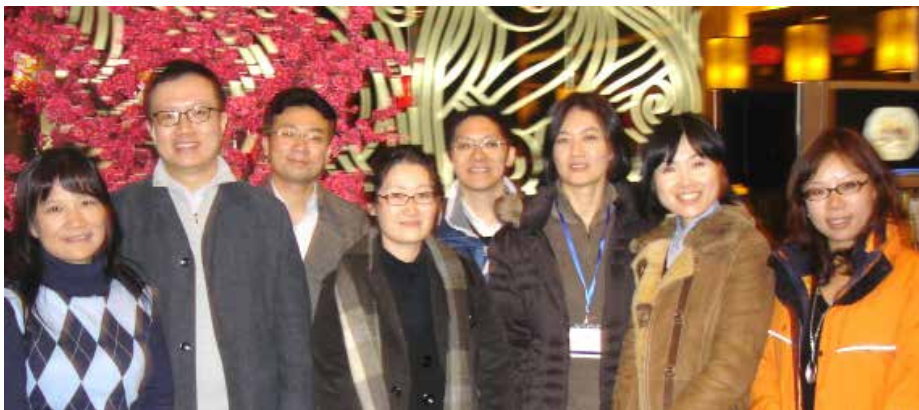
Some of the participants in IACAPAP’s Helmut Remschmidt Research Seminar Beijing, February 21-26, 2010