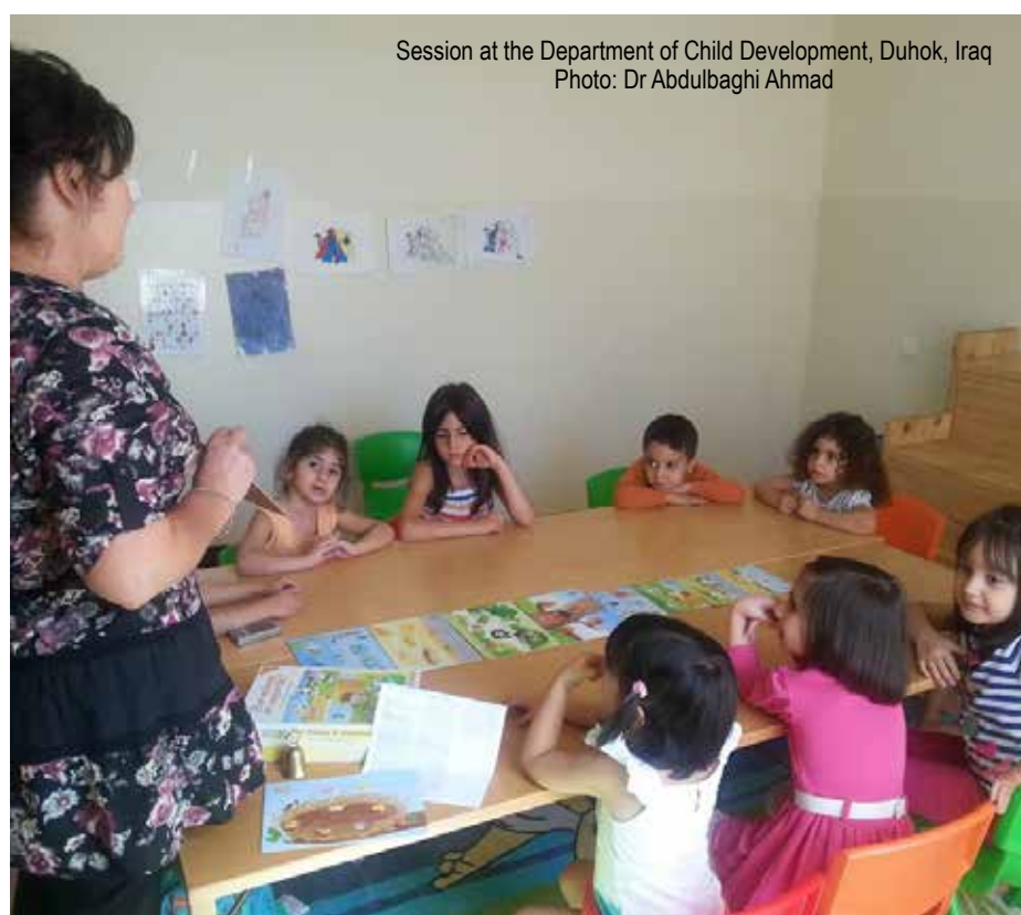
Session at the Department of Child Development, Duhok, Iraq