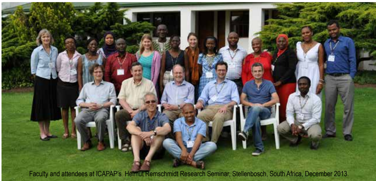
Faculty and attendees at ICAPAP's Helmut Remschmidt Research Seminar, Stellenbosch, South Africa, December 2013.