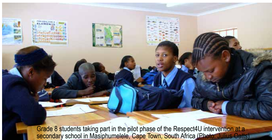
Grade 8 students taking part in the pilot phase of the Respect4U intervention at a secondary school in Masiphumelele, Cape Town, South Africa