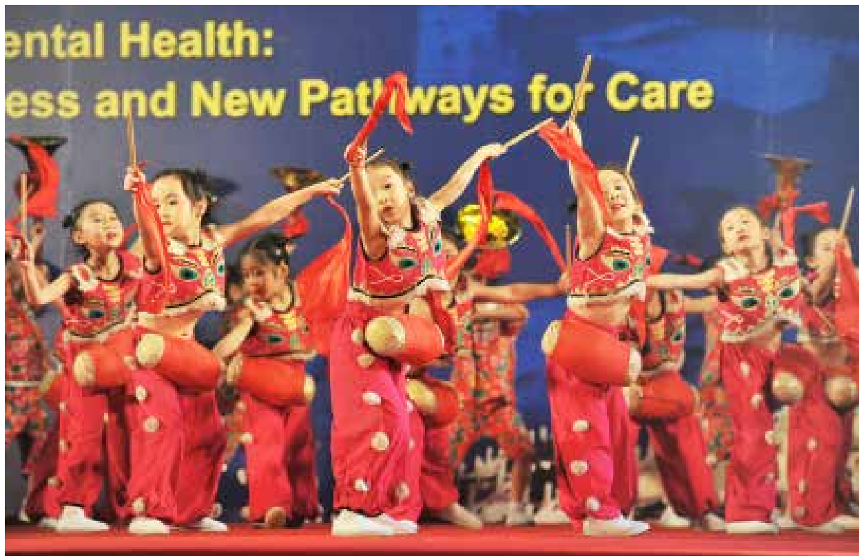
Children performing at the opening ceremony of the 2010 IACAPAP World Congress in Beijing