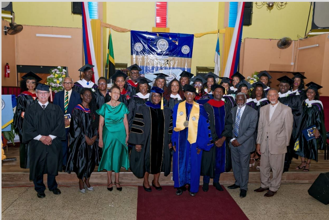
Graduating Class of 2024 with Chairman, President of CGST, President of JTS et al.